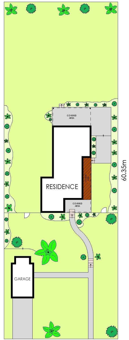
20.115m SITE PLAN (NOT TO SCALE)